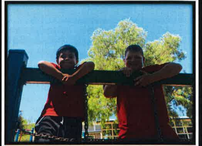
Enjoying time with our buddies