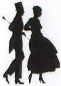
Puttin' on the Ritz