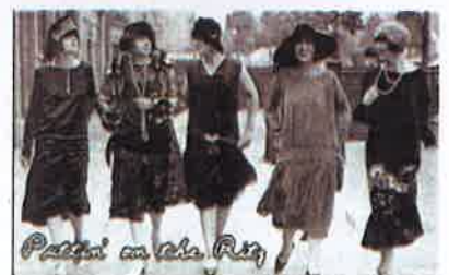
Puttin' on the Ritz